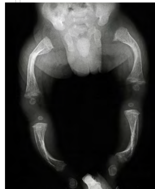
X-ray of osteogenesis imperfecta (OI), or brittle bone disease. OI is a genetic disorder that causes the bones to break easily.

“Sometimes, especially in the case of fractures, the lines can be blurred between what’s normal and what might be pathological,” Dr. Wesseling-Perry says. “In general, any concern about excess fractures, bone deformities, bone pain or a chronic condition requiring medications that can impair the bones should be referred to a specialized center for evaluation.”