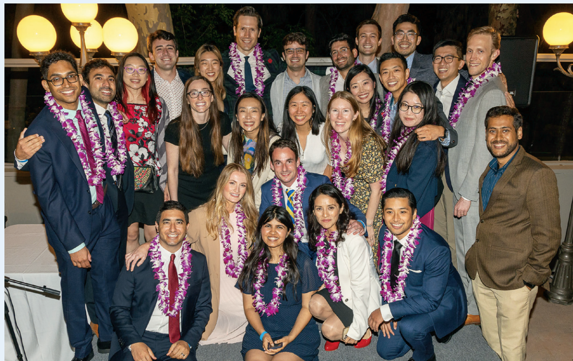
The 2022 graduating class of residents and fellows