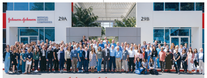
The Basic and Advanced Cataract Training Courses are extremely popular and provide opportunities to learn both tried-and-true and cutting-edge cataract surgery techniques.