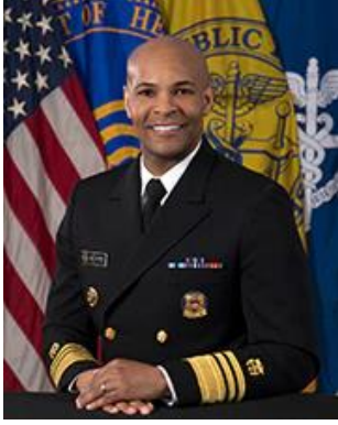
Jerome M. Adams, M.D., M.P.H. Vice Admiral (VADM)

Surgeon General of the United States U.S. Department of Health and Human Services (HHS)