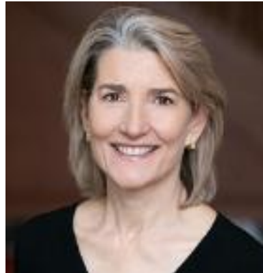
Amy C. Edmondson

Novartis Professor of Leadership and Management Technology and Operations Management Harvard Business School Harvard University Cambridge, Massachusetts