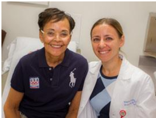
Small Cut, Big Results - UCLA Endocrine Patient Stories