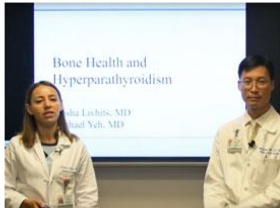
Endocrine #UCLAMDChat Webinars