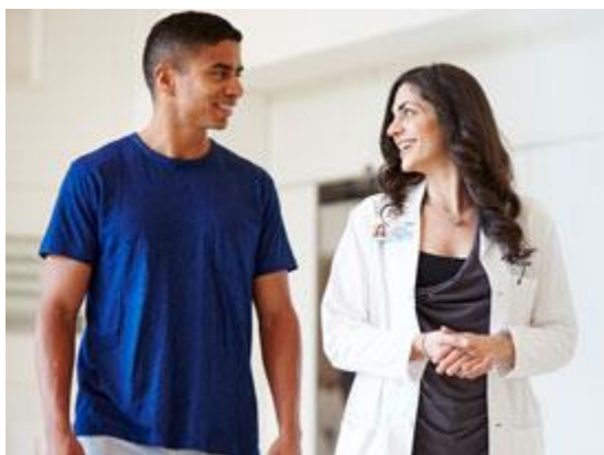
Endocrine Services Now Available in Westlake Village, South Bay and Westwood