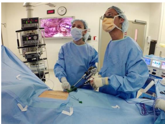
Specialized Procedure Offered Exclusively at UCLA Single-Incision Retroperitoneoscopic Adrenalectomy (SIRA)