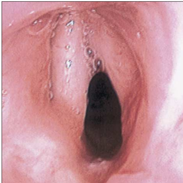
Figure 3. Endoscopic laryngeal photograph of patient 1 at the latest follow-up treatment, 123 weeks after initiation of scheduled treatments with cidofovir.

he continued to have persistent residual papillomas, and the intervals between treatments were becoming long, he was taken off the scheduled protocol at 58 weeks and placed on a 5- to 8-week treatment schedule to avoid disease resurgence. After receiving combined laser and cidofovir treatments at weeks 69, 74, 81, and 86, his larynx was found clear of papillomas for the first time at week 94. At his latest treatment (week 123) his papilloma score was 3, with flat lesions at the posterior true vocal folds bilaterally and in the anterior commissure ( Figure 3 ). Although we were not able to maintain him on the scheduled protocol, his quality of life has im-