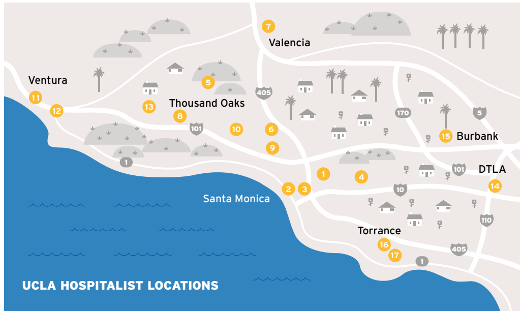
UCLA HOSPITALIST LOCATIONS