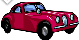
Valet Attendant Parks Vehicle