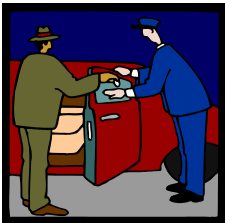
Greet & Inspect Issues Claim Ticket