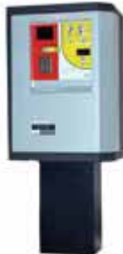
Pay at Pay Station