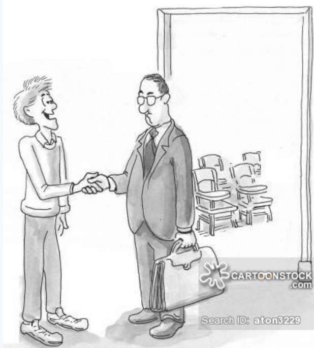
"Your lectures cured my sleep disorder."