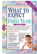
“What to Expect the First Year” Heidi Murkoff