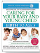
“Caring for Your Baby and Young Child, 7th Edition: Birth to Age 5” American Academy of Pediatrics