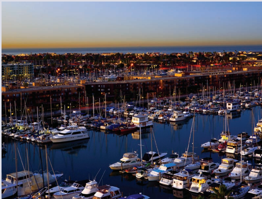
View from the Ritz-Carlton, Marina del Rey