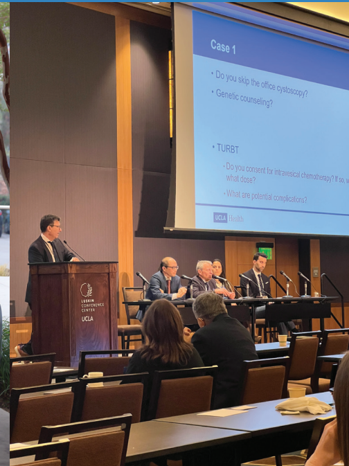
Among the many ways UCLA Urology is making a difference both within and beyond the research, training, and patient care it provides: A partnership with Bridge Builders (left) exposes middle- and high school students to medicine and other STEM careers; and at the State-of-the-Art Urology Conference (right), which recently held its 50th annual meeting as the nation's longest-running specialty program, faculty and other experts explore the most challenging management problems facing practicing urologists.