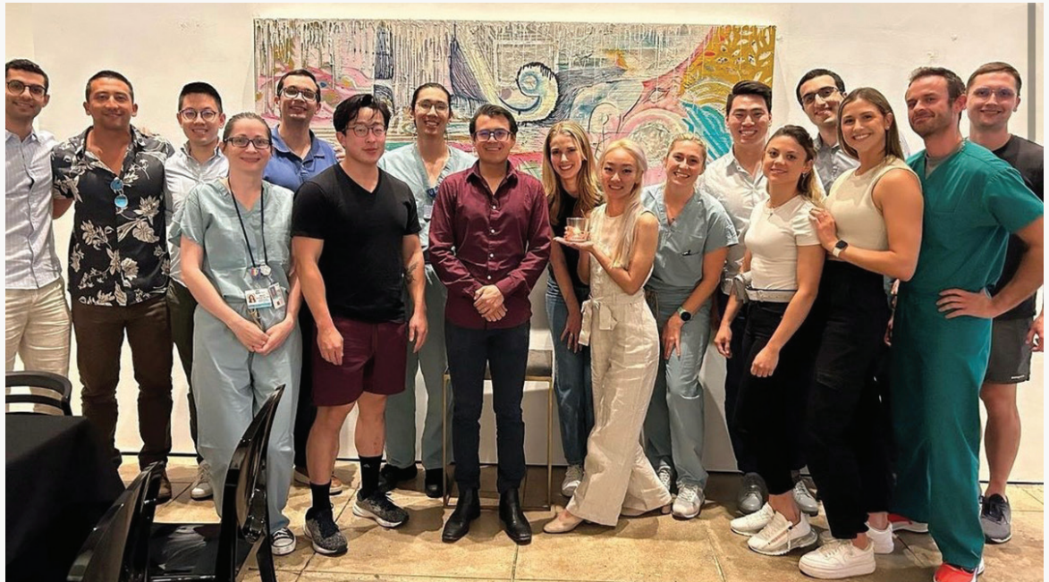
Resident Wellness dinner at Wolfsglenn in Westwood.