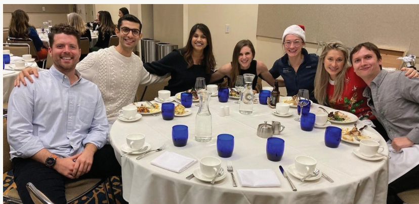
Trainee holiday dinner hosted in Carnesale Commons on the UCLA campus.