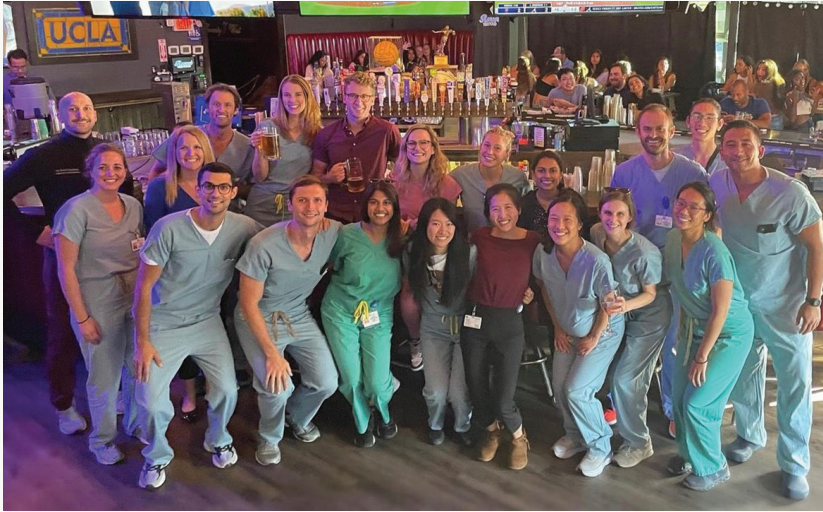
UCLA radiology residents and fellows enjoying a Wellness Social Hour at Rocco's.