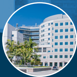
Ronald Reagan UCLA Medical Center

Los Angeles provides varied clinical-care opportunities that prepare trainees for practically any future challenge.