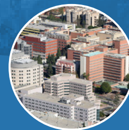
UCLA Medical Group