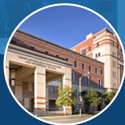
Santa Monica/ UCLA Medical Center and Orthopaedic Hospital