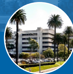
West Los Angeles VA Medical Center