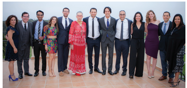
Faculty and fellow attendees overlooking the 18th hole of the beautiful Riviera Country Club.