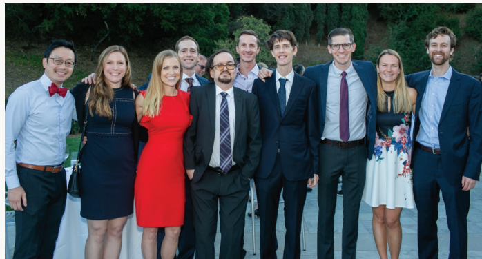
Graduating resident class