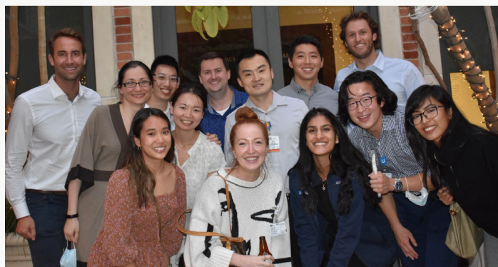
First year resident class