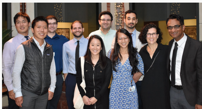
Abdominal imaging/CSIR fellows and faculty