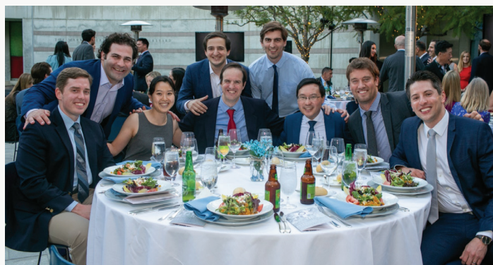
Diagnostic and interventional radiology residents