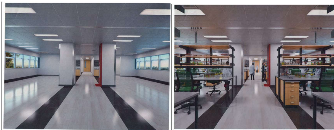
New research spaces at David Geffen School of Medicine

One floor of this building is committed to each of the research themes. In addition, a number of floors are committed to public-private partnerships with industry for projects of mutual benefit.