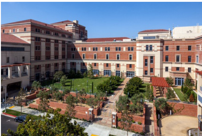
UCLA Medical Center, Santa Monica as seen from 15th Street; Nethercutt Emergency Center entrance is in the lower right corner.

by joining a group of friends, colleagues, and fellow philanthropists to support the UCLA Arline and Henry Gluck Stroke Rescue Program and the UCLA Health Mobile Stroke Unit