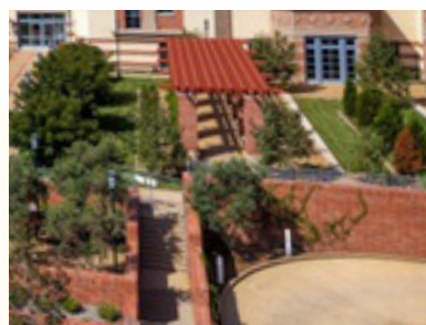
Detail of the current Meditation Garden to be renamed the Ghurabi Garden.