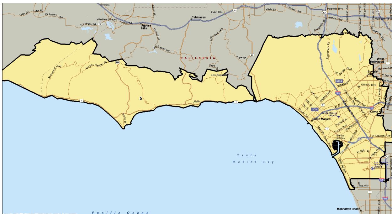
Los Angeles County Department of Public Health Service Planning Area 5

UCLA Health plays a critical role in providing healthcare services and community benefit in its service area, Los Angeles County Department of Public Health Service Planning Area 5 (SPA 5), which includes 28 zip codes and represents 18 cities or communities.