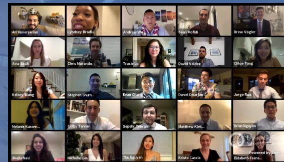
Class of 2020 Zoom Graduation

UCLA Department of Anesthesiology & Perioperative Medicine