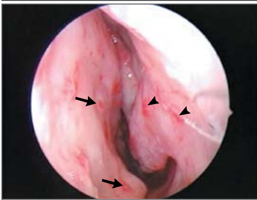
Figure 2. Endoscopic Image Showing Nasal Telangiectasias.

The classic features of hereditary hemorrhagic telangiectasias can be seen along the left anterior septum (arrows) and the left inferior turbinate (arrowheads).