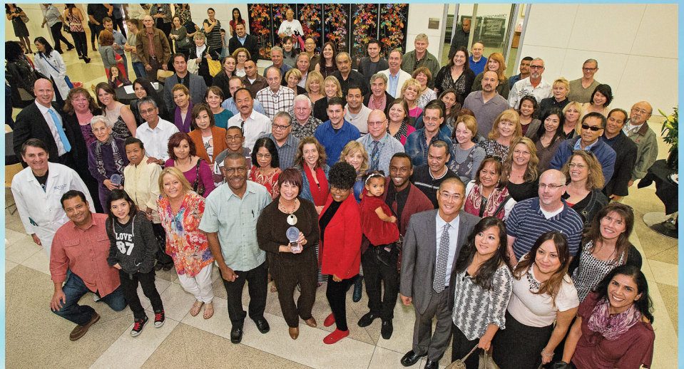
Celebration of the 100th transplant of the UCLA Kidney Exchange Program.