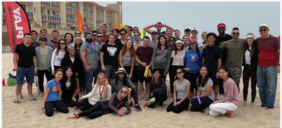
Residents at the radiology resident retreat in Hermosa Beach on November 5, 2021

On November 5, 2021, the chief residents organized a day-long retreat for all radiology residents. The retreat took place in Manhattan Beach and was filled with team-bonding activities. The residents used this time to set goals for the academic year and learn more about one another.