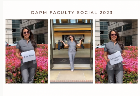
DAPM FACULTY SOCIAL 2023

DAPM had a strong showing at the LA Pride Parade and Pride Night at Dodgers Stadium.