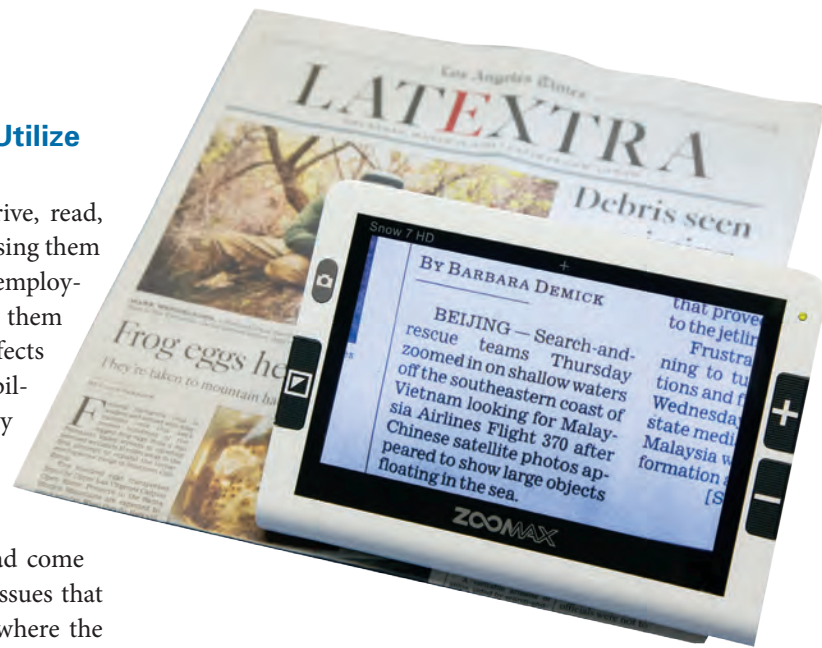
Easily transportable video magnifiers enlarge text and enhance the contrast of reading materials.

By using low-vision devices and applying strategies learned in the VRC, Sheree was able to resume her work as a bank teller and participate more fully in her daughter’s life. “During Presley’s first year, I wanted to capture all of those ‘couldn’t see’ moments, and I was taking a ton