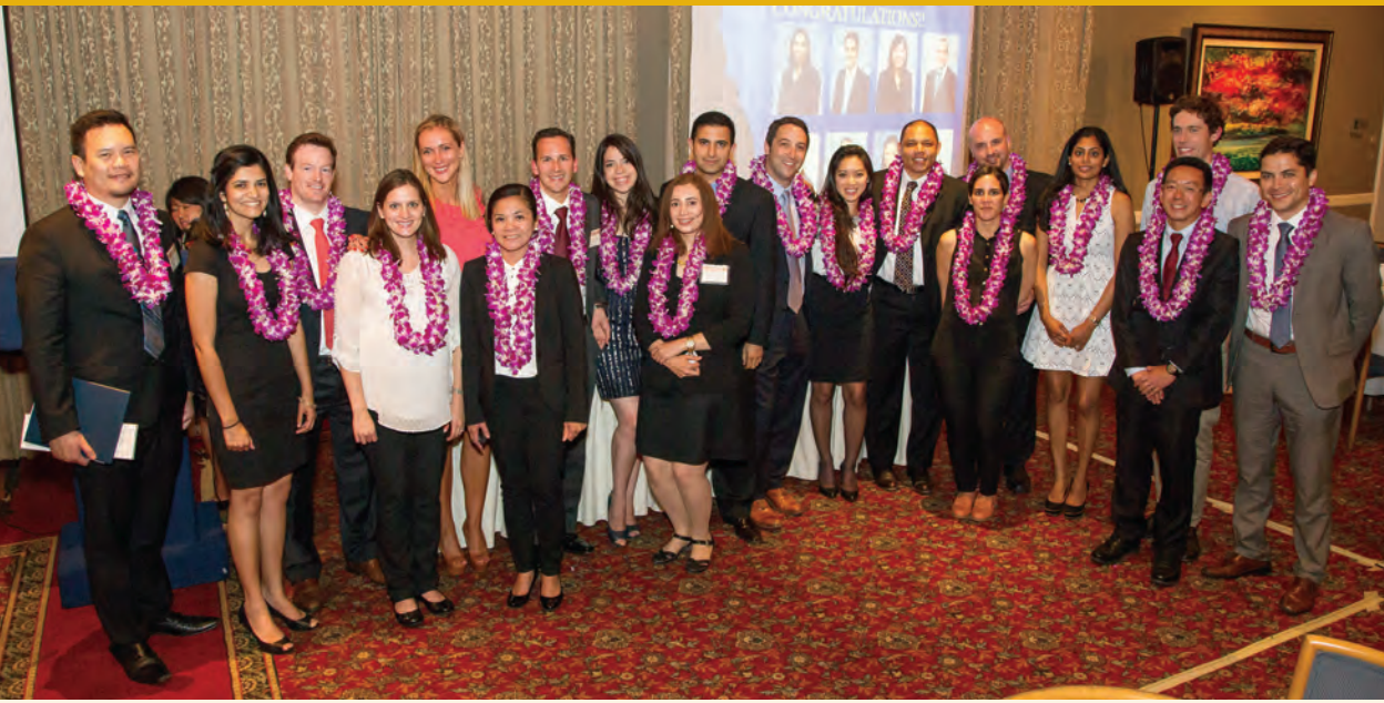
2014 Fellowship Graduates

Stein Eye offers a variety of options to those who may also wish to support our tradition of excellence and contribute during this season of giving. For more information on ways to donate, we invite you to contact our Development Office at (310) 206-6035 or giving@sei.ucla.edu .