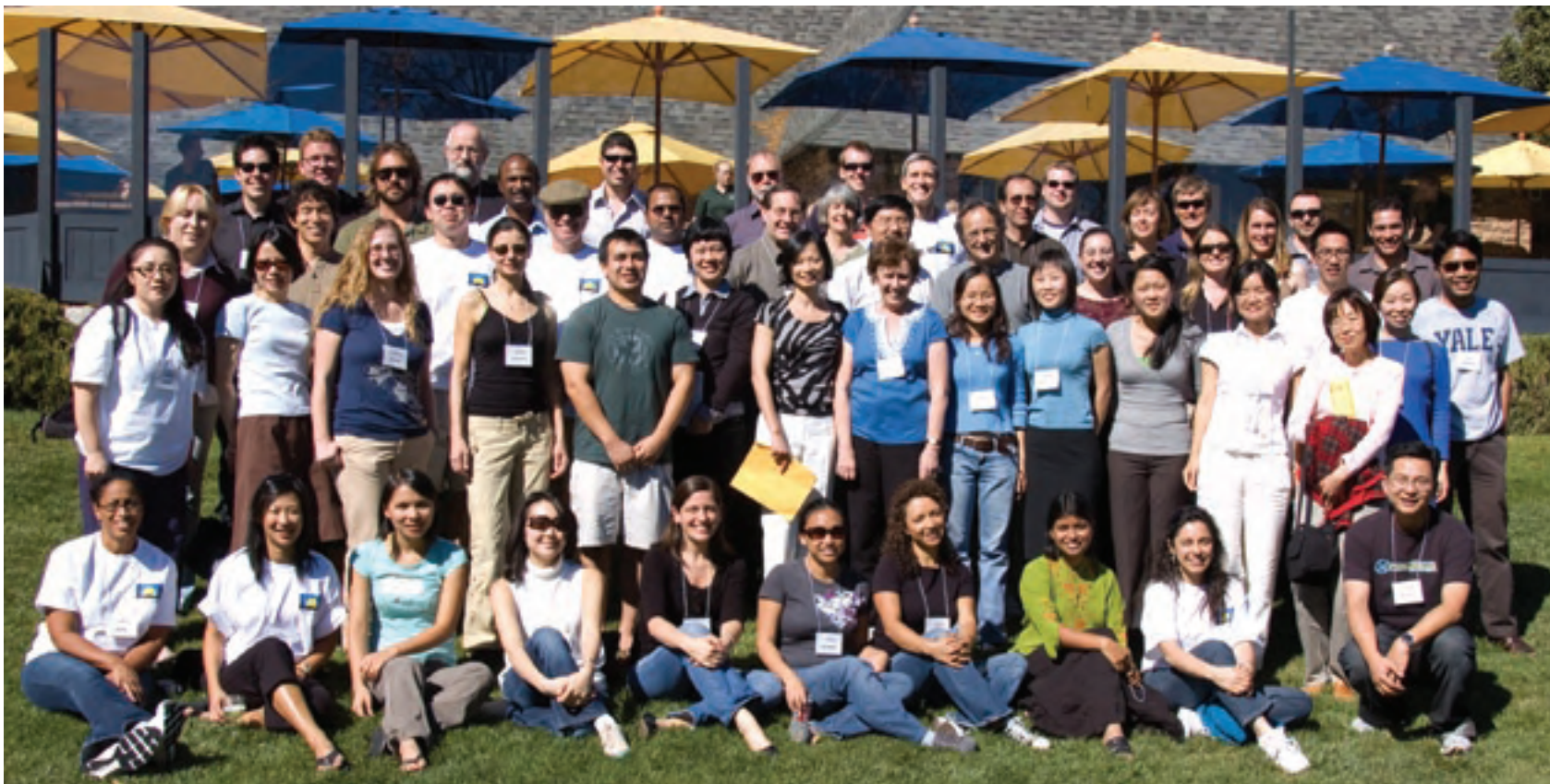
Over 80 basic scientists and clinical researchers attended the Fourteenth Annual Vision Science Conference in Lake Arrowhead, California.