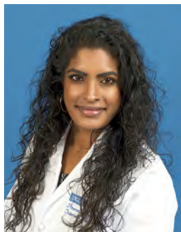
Anuradha Seshadri, MD

"Always carry prescription medications with you to avoid theft, loss or damage due to extreme temperature changes," Dr. Bao says. "Keep medicines in their original pharmacy containers in case you need to verify the medications, and pack extra doses for unexpected travel delays." And check to make sure that your prescription medications are allowed in the country to which you are traveling, Dr. Seshadri says. It's also a good idea to bring an emergency medical kit stocked with bandages; medicines for headaches, diarrhea, nausea and allergies; and creams for rashes, mosquito bites and sunburn.