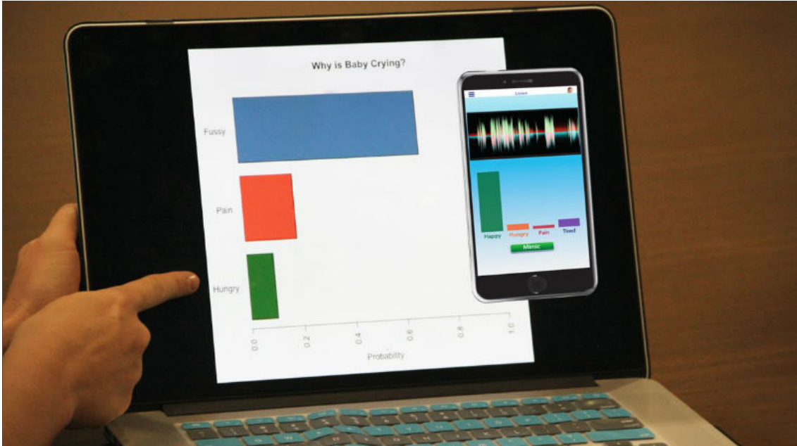
BBC World News: Interest in ChatterBaby app goes global

Note: Website links may expire without notice. Some sites require password registration. If you cannot access a story or would like to obtain a copy, please call (310) 267-7022.